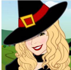
Latest Book Cover